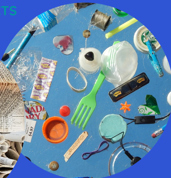
2017-2018 Durant Middle School Durant