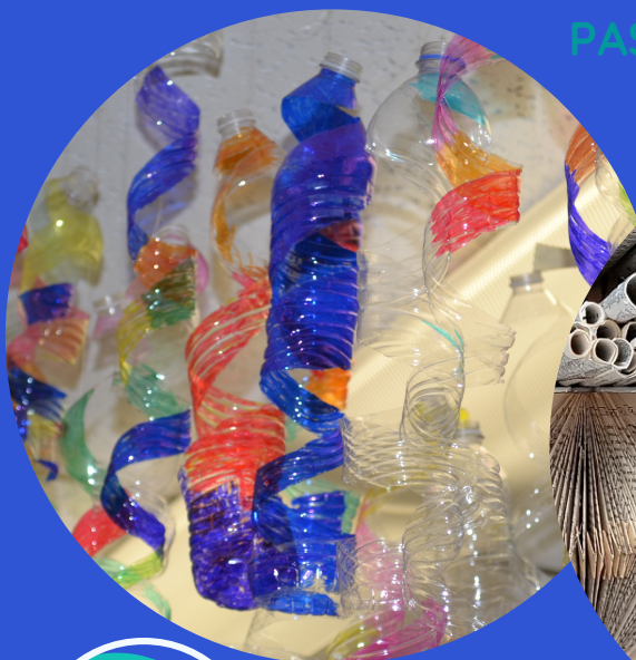
2018-2019 Eisenhower Middle School Lawton