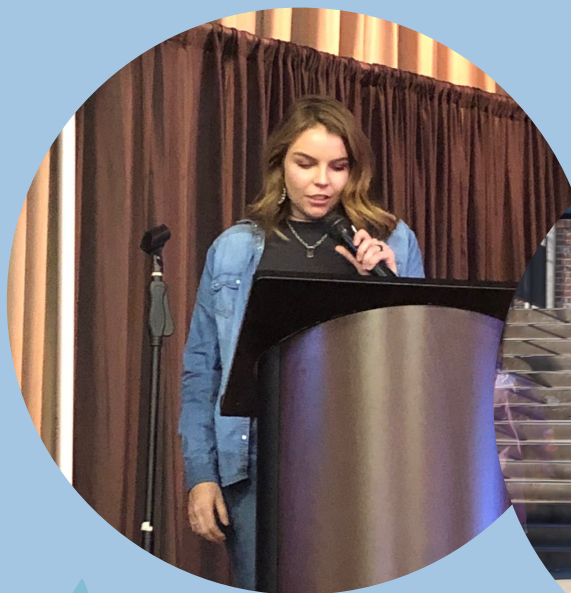
2019-2020 High School Mooreland High School Mooreland