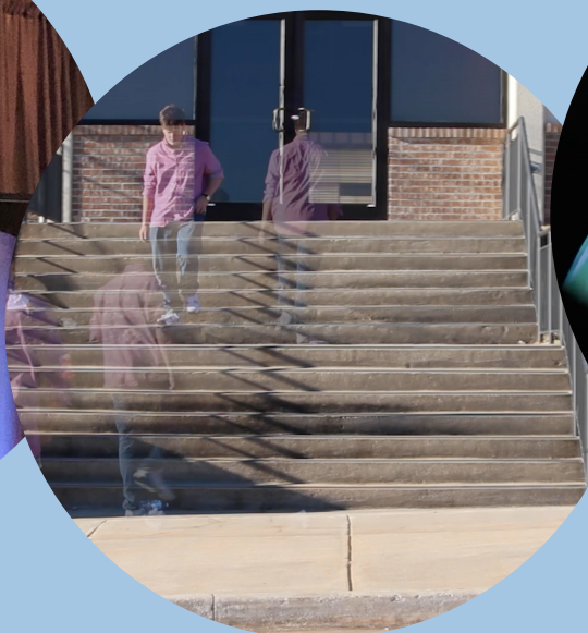
2020-2021 High School Eastern Oklahoma County Technology Center Choctaw