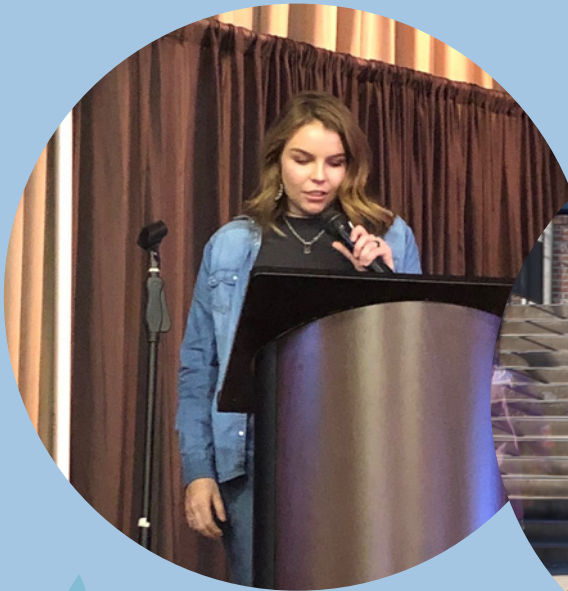
2019-2020 High School Mooreland High School Mooreland