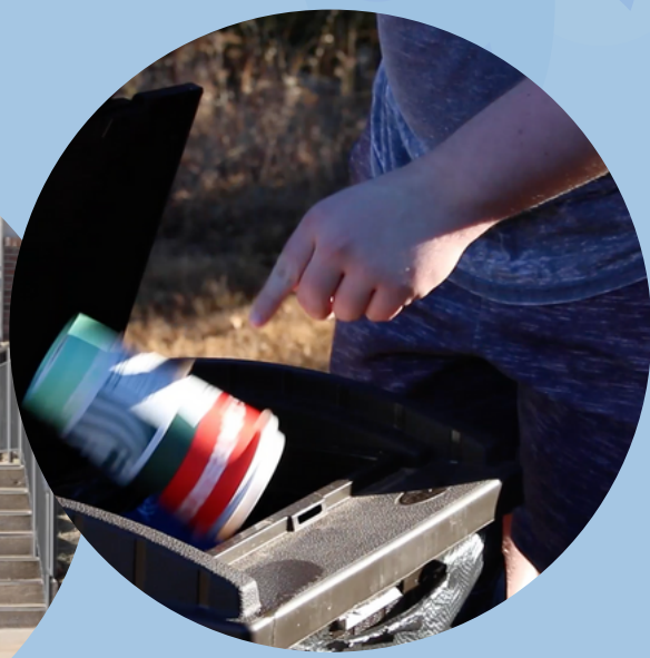
2020-2021 College Eastern Oklahoma County Technology Center Choctaw