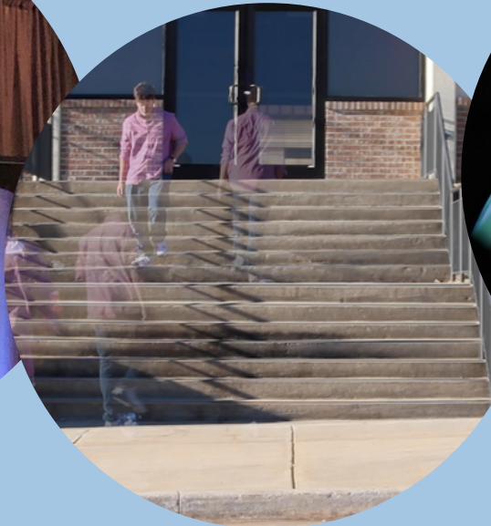
2020-2021 High School Eastern Oklahoma County Technology Center Choctaw