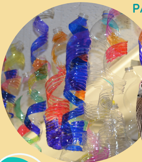
2018-2019 Eisenhower Middle School Lawton