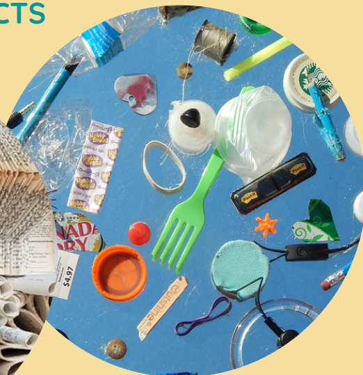
2017-2018 Durant Middle School Durant