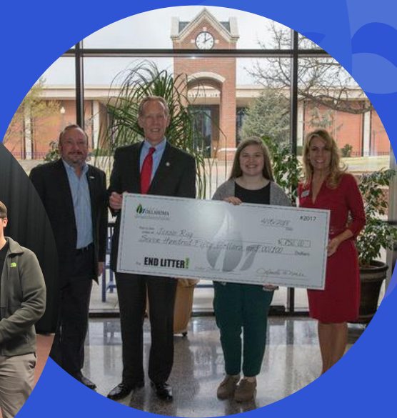
2018-2019 College Southeastern Oklahoma State University Durant