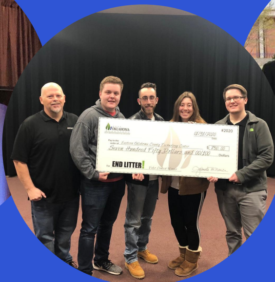
2019-2020 College Eastern Oklahoma County Technology Center Choctaw