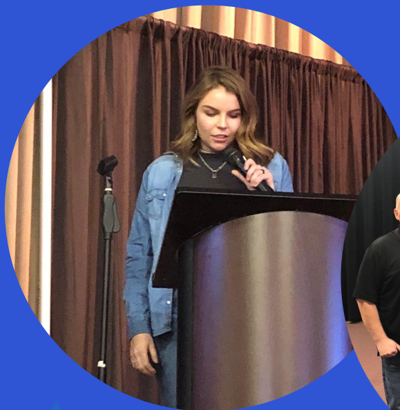
2019-2020 High School Mooreland High School Mooreland